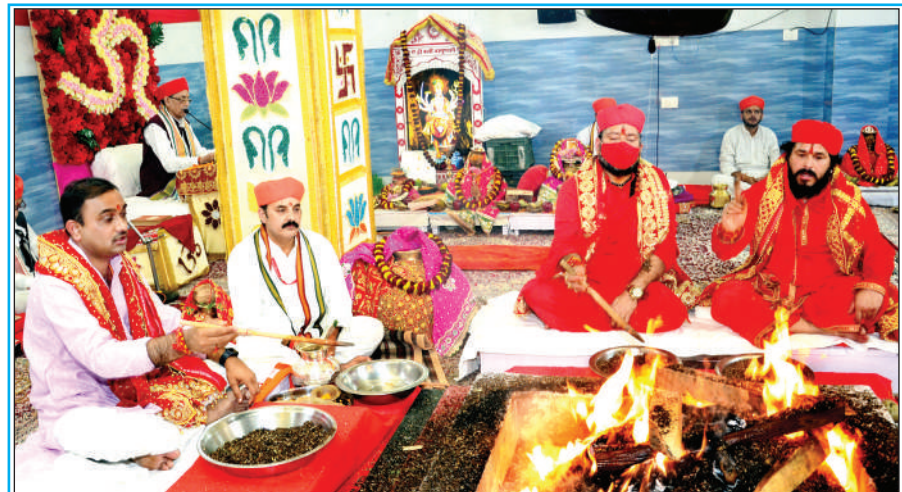
Shat Chandi Maha Yagya' for universal peace concluded at Shri Mata Vaishno Devi Shrine.