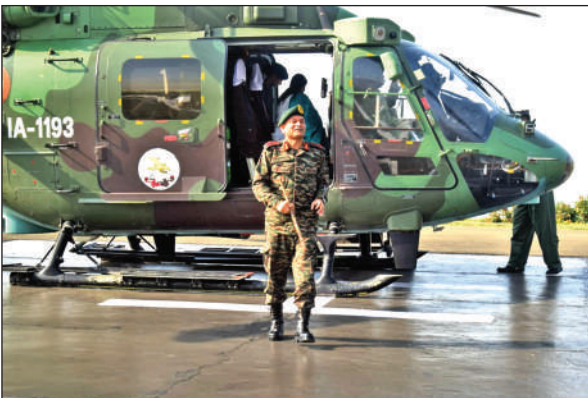
Northern Army Commander Lt General Upendra Dwivedi on his arrival at Srinagar on Sunday.