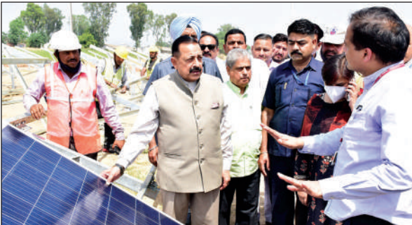
Union Minister Dr Jitendra Singh along with a high level Central team, visiting the venue of PM Narendra Modi's rally at Pali Panchayat Samba on Monday.

■ STATE TIMES NEWS JAMMU: Elements misusing festivals to create an unnecessary dispute are anti-national, Union minister Jitendra Singh said on Monday, asserting all festivals should be observed like festivals only. He also expressed satisfaction over the arrangements being made for the upcoming annual Amarnath Yatra in south Kashmir Himalayas and said J-K Lieutenant Governor Manoj Sinha is personally supervising the steps for its success. Interacting with media persons at Pali Panchayat in Samba district, the minister, while responding to a question about attempts by certain elements to disturb