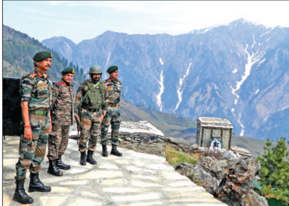
Northern Army Commander Lt Gen Upendra Dwivedi during his visit to forward posts in Srinagar.