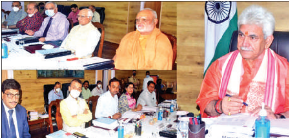
LG Manoj Sinha chairing meeting of newly constituted Shri Mata Vaishno Devi Shrine Board on Tuesday.

Facilities like skywalk, new Durga Bhawan, spiritual theme park being created