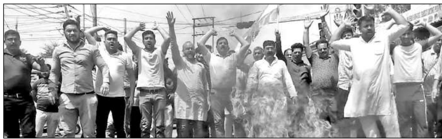
Protestors raising slogans against Pakistan sponsored terrorism during a protest at Jammu.