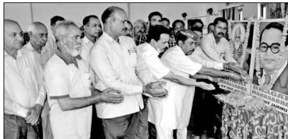
Bhagat Mahasabha members paying tributes to Dr Bhim Rao Ambedkar.

Bhagat Mahasabha celebrated 131st birth anniversary of Dr Bhim Rao Ambedkar at Prem resort, Akhnoor road, Jammu.