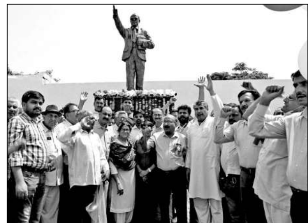
JKRCEA and BRAES members paying tributes to Dr Bhim Rao Ambedkar.