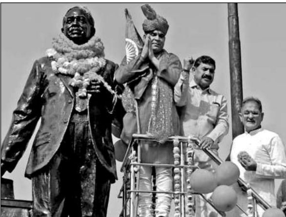
J&K BJP President Ravinder Raina and other leaders paying tributes to Dr Bhim Rao Ambedkar.

Bharatiya Janata Party (BJP), Jammu & Kashmir led by