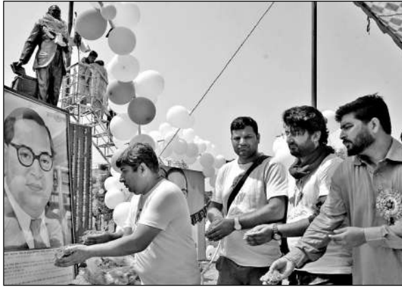
BAJCC members paying tributes to Dr Bhim Rao Ambedkar.

Ambedkar Mela was organised by Babasaheb Ambedkar Jayanti Celebration Committee (BAJCC) in Jammu to commemorate 131st birth anniversary of Dr Ambedkar. A large