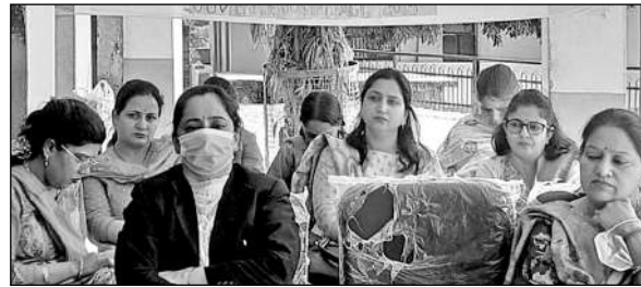
DLSA Reasi members during awareness camp.