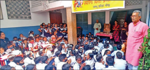
Kreedha Bharati members during celebration of Foundation Day.