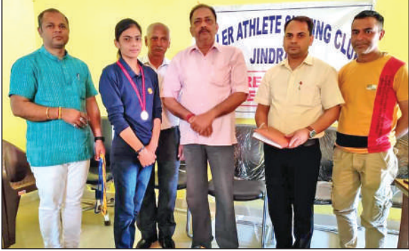
RASC members posing with a winner student.

■ STATE TIMES NEWS JAMMU: The Roller Athlete Skating Club (RASC) Jindrah, under its Swach Bharat Abhiyaan series, organised painting contest, poetry recitation and awareness rally under the banner of 'Swach Bharat Abhiyaan' at village Jindrah in block Dansal. The events were organised under the supervision