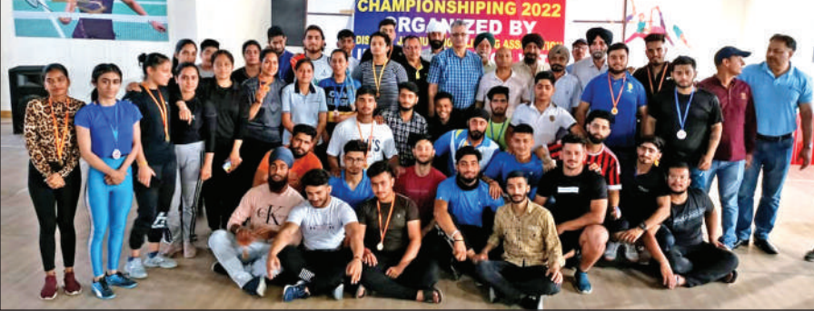
Medal winners posing for a photograph with dignitaries.