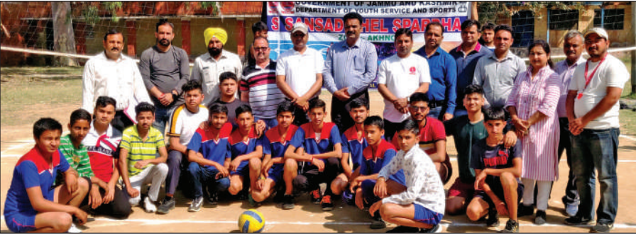
Volleyball teams posing for a photograph with dignitaries.

■ STATE TIMES NEWS AKHNOOR: As part of Inter Panchayat Zonal Level Competitions being held under the ages of 'Sansad Khel Spardha' for boys under-17 years, started at GBHSS, Akhnoor, a total of 70 players drawn from different Panchayats of Zone Akhnoor were participated on day two in the discipline of volleyball. In the final match, Kotli Tanda Panchayat beat Gurha Brahmana East Panchayat. Besides, competitions of Kabaddi were also com-