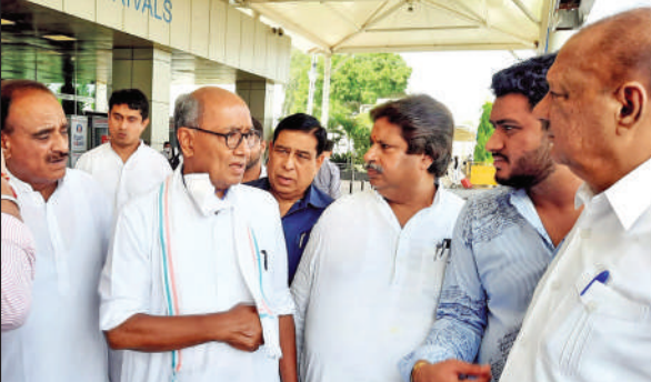
Senior Congress leaders welcoming former CM of Madhya Pradesh, Digvijaya Singh at Jammu Airport.

In a brief meeting at airport, Digvijaya Singh said that Congress is the only alternative available to the people in J&K and people have made up their mind to