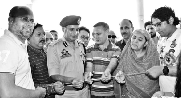
Dignitaries inaugurating the Mela.