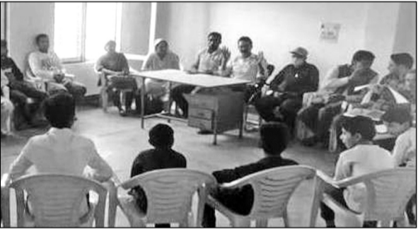
RDD officials interacting with Youth Club members.

■ STATE TIMES NEWS RAMBAN: Department of Rural Development and Panchayati Raj Ramban on Monday organised interactive sessions with Youth Club & Self Help Groups and students under the aegis of Gram Swaraj Month campaign. On the occasion door to door campaign on Swachh Gram Mission was conducted to encourage the people to maintain cleanliness and sanitation in their localities. The PRIs along with officers from Rural Development and other line departments besides the general public participated in