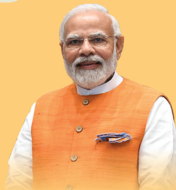
Narendra Modi Prime Minister