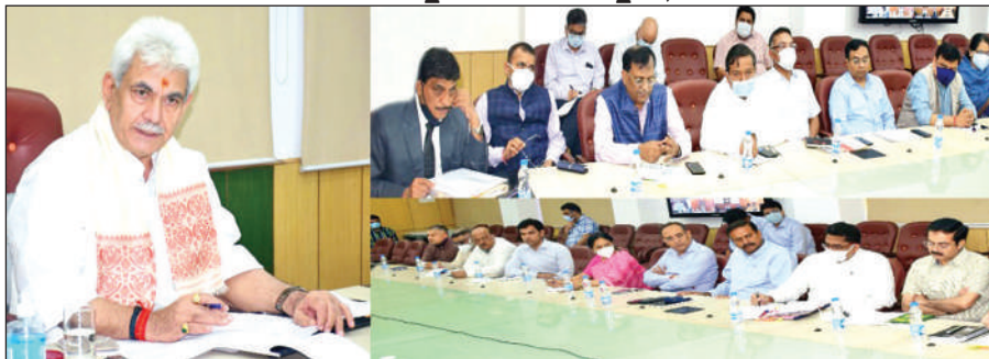
LG Manoj Sinha chairing high-level meeting on effective implementation of initiatives announced in J&K UT Budget 2022-23.

■ STATE TIMES NEWS JAMMU: Lieutenant Governor Manoj Sinha on Friday exhorted the Administrative Departments and District Administrations in Jammu and Kashmir to work in close-coordination and furnish the UT and District Plans in consultation with public representatives and other stakeholders to realize the vision of 'Sabka