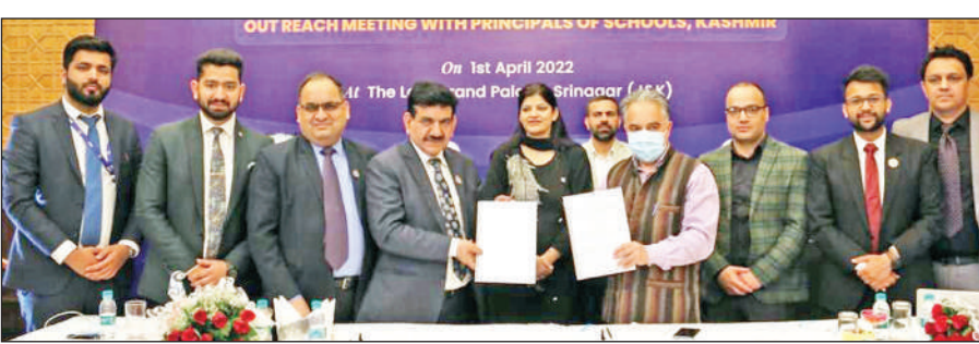
Representatives of ICAI and DSEK after signing MoU.