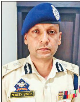
of Police Martyrs and their families. He has also prayed for