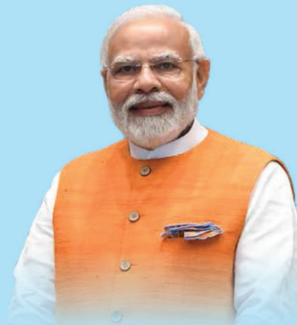
Narendra Modi Prime Minister