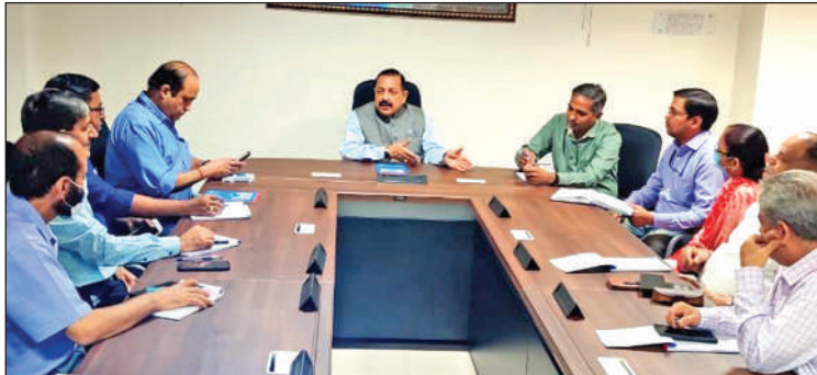
Union Minister Dr Jitendra Singh reviewing preparation of Technology Stalls being put up in the exhibition at the venue of PM's rally at Palli, Samba.

He had already inspected the 500 KV Solar Plant and other exhibition themes on Tuesday at the Palli