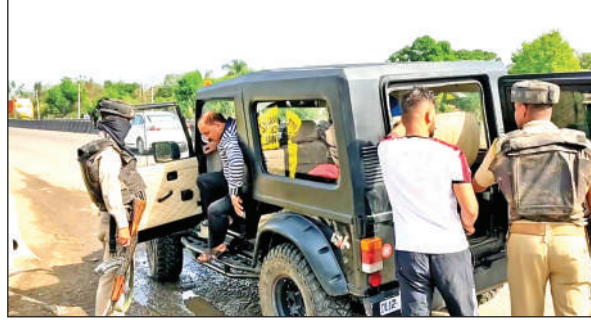
Security forces carrying out checking of commuters on NH at Samba on Friday.