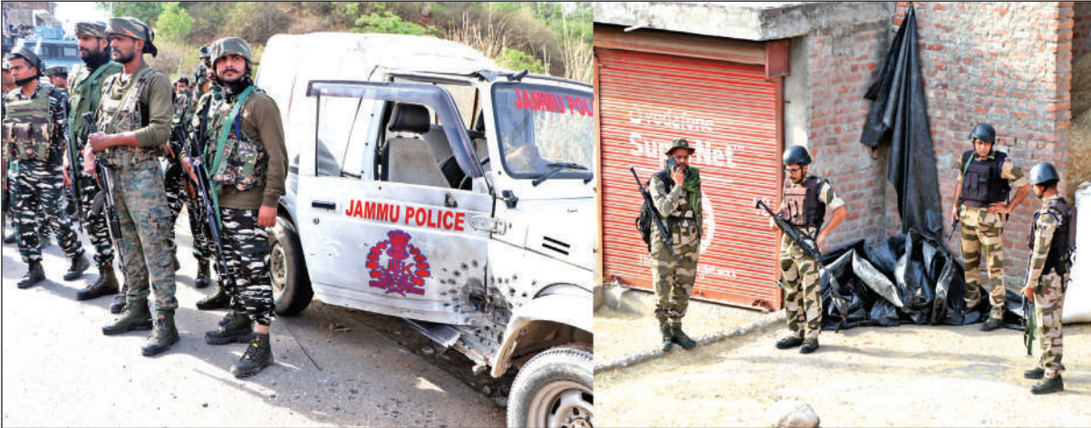
Security forces at the encounter site near Army camp in Sunjwan area.

(More pics of Page 4)