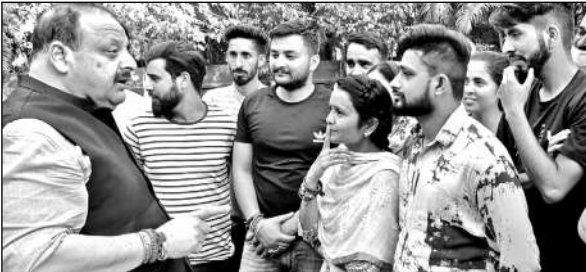
Prominent BJP leader Devender Singh Rana interacting with delegations members.

of the investment to Rs 75,000 crore by this year's end from Rs 14,000 crore, five times the private investment that happened