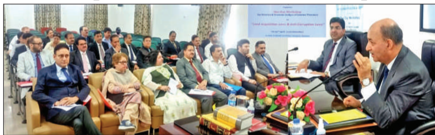
Former Judge, High Court of J&K, Justice Bansi Lal Bhat speaking at a workshop.

Justice Bansi Lal Bhat, Former Judge, High Court