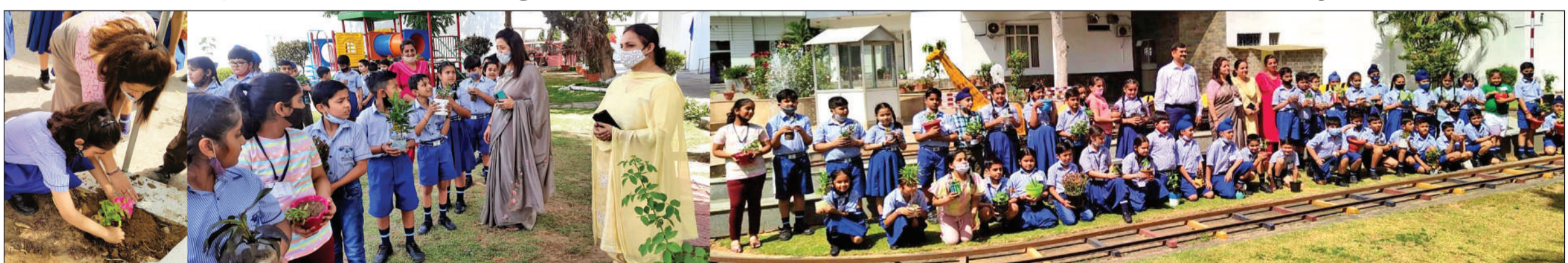
Students and faculty members during the Earth Day celebrations.