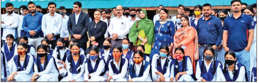
Students and faculty during awareness programme.

Secondary School Kud by District Legal Services Authority Udhampur in collaboration with the management of the host school. The