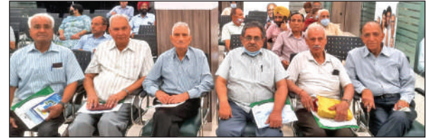
Senior Citizens during eye-checkup camp.