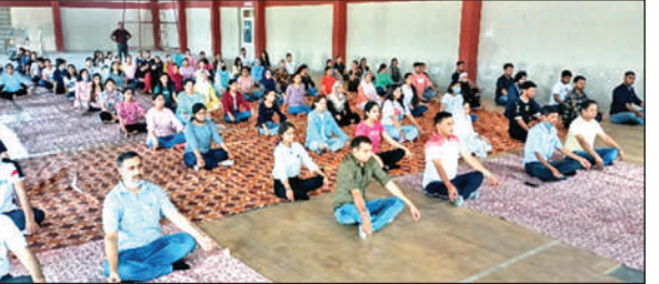
Participants performing Yoga Aasans.