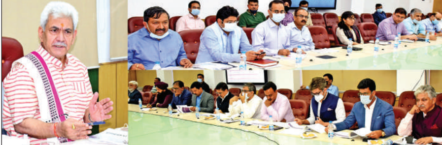
LG Manoj Sinha chairing preliminary meeting for Second Real Estate Summit at Srinagar.

LG chairs preliminary meeting for forthcoming Real Estate Summit in Srinagar