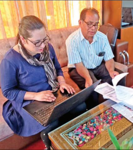
EPFO official settling claims.

JAMMU: EPFO Regional Office, Jammu has taken some proactive measures in the recent past to come up to the expectations of the stakeholders. The EPFO is providing social security to all its members despite several hurdles and obstacles coming in the way. There has been a significant improvement in the daily settlement of claims which has increased from around 500 to more than 1000 claims daily. The dedicated team of EPFO RO Jammu, Kashmir and