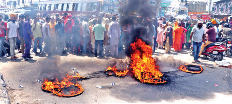
Protesting residents blocking Satwari-R S Pura road during protest against PDD.

lyzed their routine life. "The PDD is testing our patience as we have been facing hardships due to a power crisis for the last one week. The children, old and infirm are the worst sufferers, who cannot live without power in this hot weather," they said, adding that despite their repeated pleas, the PDD has failed to resolve the problem. "Even during night hours,