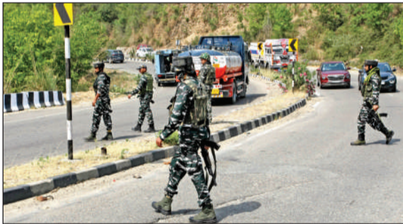
Security forces on National Highway near Sidhra where IED was detected on Thursday.

A police spokesperson said an explosive device was found there. The site was cordoned off and the device was