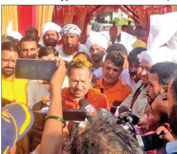
RSS leader Indresh Kumar talking to reporters at a function organised by Muslim Rashtriya Manch in Jammu on Saturday.