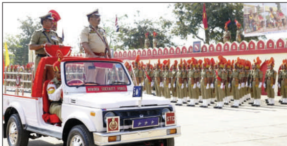
DGP Dilbag Singh inspecting attendance-cum-passing out parade at STC Udhampur on Saturday.