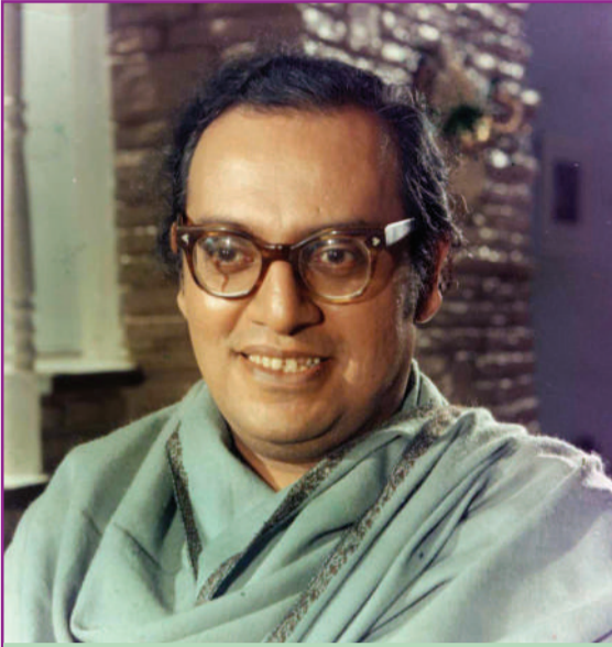
Utpal Dutt (29 Mar, 1929 – 19 Aug, 1993)