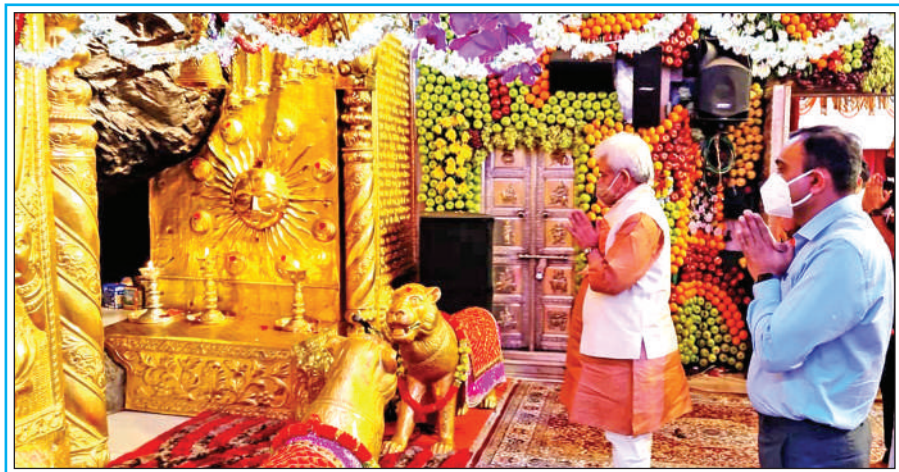
LG Manoj Sinha paying obeisance at the Holy Shrine of Shri Mata Vaishno Devi Ji.