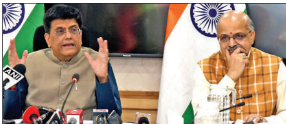
Union Minister for Commerce & Industry, Consumer Affairs, Food & Public Distribution and Textiles, Piyush Goyal addressing a press conference in New Delhi. Commerce Secretary, B.V.R. Subrahmanyam is also seen.

The exports have witnessed a significant growth in non-