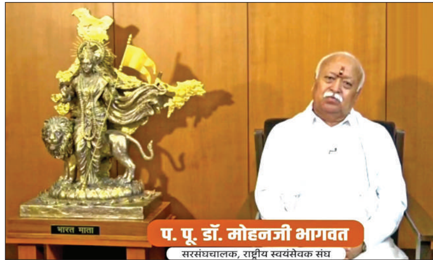
RSS Chief Mohan Bhagwat addressing members of Kashmiri Pandit community on Sunday.

It won't take many days for the fulfilment of our pledge of returning to the valley. It will come true very soon and we have to continue making attempts in this direction. Our history and our