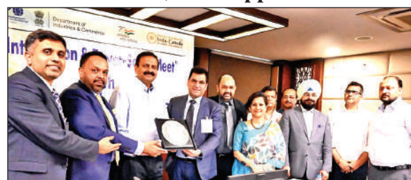
JKPTO members honouring ICCC delegation in Jammu.