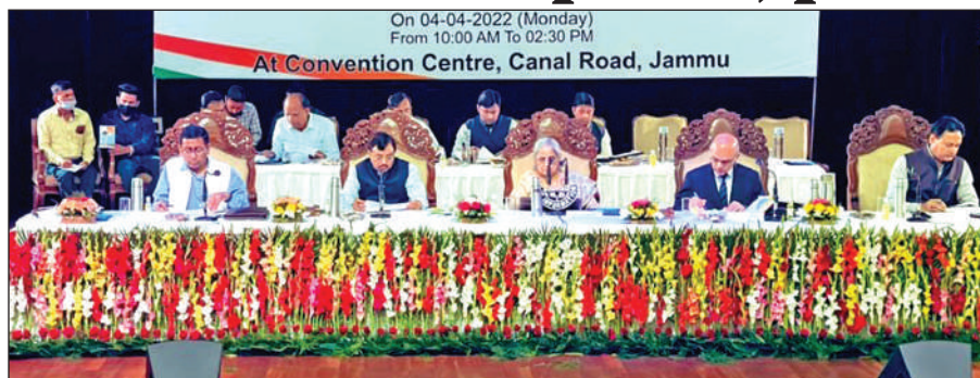
Members of Delimitation Commission during first day of public sittings in Jammu on Monday.