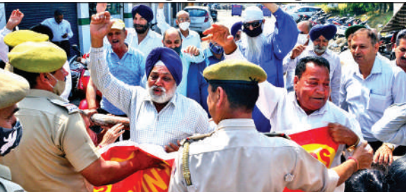
VRS employees staging protest in Jammu.