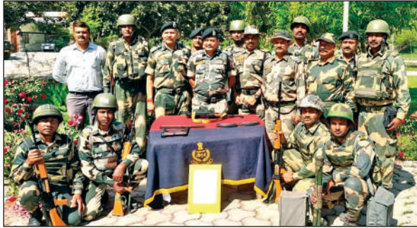
Arms and ammunition seized by security forces at Akhnoor.

The troops were on high alert following the adverse inputs and were regularly patrolling the areas near the