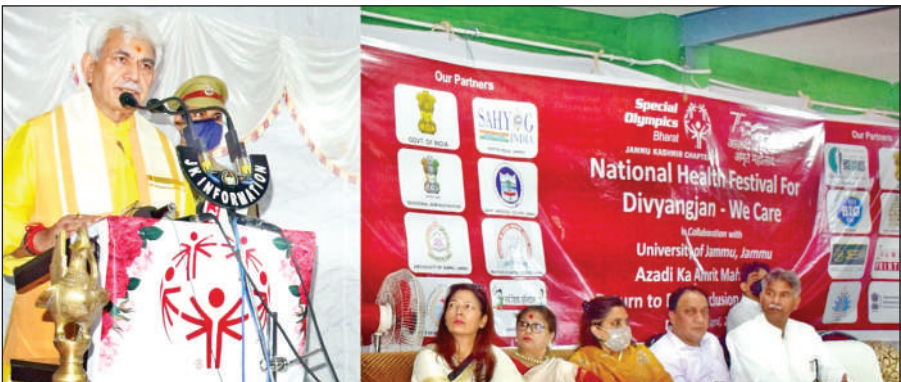
LG Manoj Sinha during National Health Festival organised in Jammu to honour specially-abled sportspersons on Thursday.

The programme is being organized on World Health Day in connection with "Azadi Ka Amrit Mahotsav" in 75 cities of India marking the 75 years of independence, by Special Olympics Bharat,