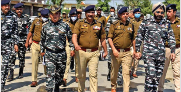
DGP Dilbag Singh during visit to Pulwama & Shopian districts to review security scenario.