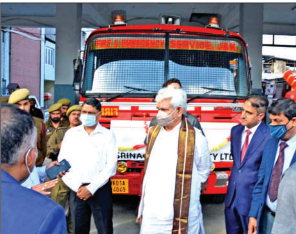
LG Manoj Sinha after laying foundation stone for various Smart City projects in Srinagar.