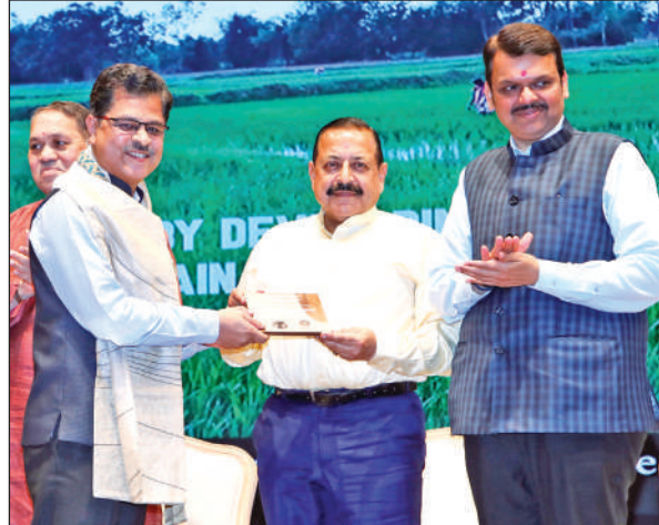
Union Minister Dr Jitendra Singh, as Chief Guest, presenting "Yashraj Bharati Samman" Awards at Mumbai. Also seen is Deputy Chief Minister of Maharashtra, Devendra Fadnis.

■ STATE TIMES NEWS MUMBAI: Union Minister, Dr Jitendra Singh, who is also Minister Incharge DoPT (Department of Personnel & Training), said here on Sunday that over 2,000 obsolete rules and laws were scrapped by the Government of India in the last 9 years, for ease of governance and ease of business. Speaking as Chief Guest after presenting Yashraj Bharati Samman (YBS) Awards at a 'Gratitude ceremony' organised by the Yashraj Research Foundation (YRF) here, Dr Jitendra said that unlike the earlier governments which found comfort in status quoist approach, Prime Minister Narendra Modi has demonstrated the courage and conviction to do away with such rules which were causing inconvenience to the citizens and many of which that had persisted since the time of British Raj. The ultimate aim of good governance is to bring ease of living to the citizens, he said.