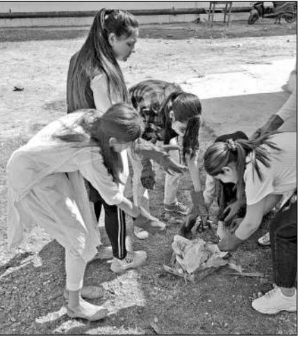
NSS volunteers collecting garbage.

KATHUA: In continuation to its activities under Swacch Bharat Abhiyan, NSS volunteers of Government Degree