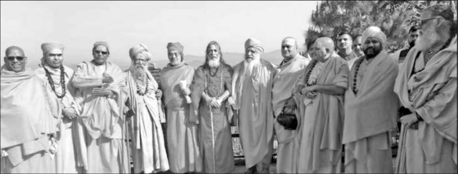
Religious scholars during the concluding ceremony of Bhagwat Saptah at Suderbani.