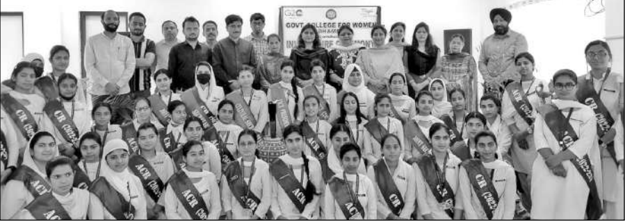
Faculty along with students during the investiture ceremony.