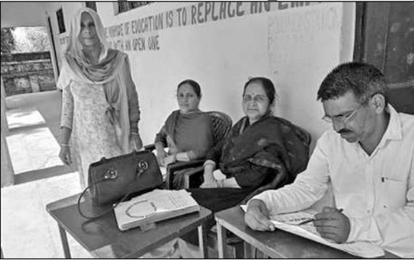
People participating in voters' awareness camp.

KATHUA: Under the ongoing SSR (Special Summary Revision), the district administration Kathua on Saturday organized special camp at all designated polling stations. This is a part of the revision of the electoral rolls being conducted to include new voters and make amendments to the epic of the old voters. EROs and AEROs, visited various polling booths to oversee the Summary Revision process besides officers dispensed requisite forms to new voters and encouraged them to register themselves and their peers who have attained eligible age as of April 1st. The district election office has already directed Booth Level Officers to work with utmost dedication and caution in regis-