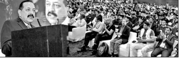
Union Minister Dr Jitendra Singh, who is also a nationally known Diabetologist, delivering inaugural address at the 3-day World Diabetes Meet organised by "Diabetes India", at Indore.