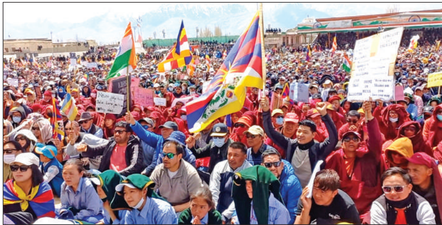
People from different walks of life during a rally at Leh.

A peaceful protest rally was taken out from NDS ground by thousands of people. It passes through P. Namgyal road all the way to Leh Pologround where a mammoth gathering was addressed by leaders from LBA, LGA,