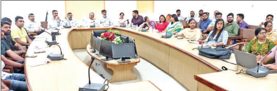
Revenue Department officials during a training session.