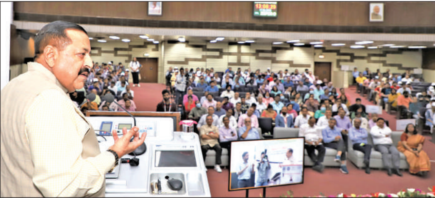
Union Minister Dr Jitendra Singh speaking after launching 'YUVA' portal and 'One Week One Lab' programme, at National Physical Laboratory (NPL), New Delhi on Monday.

Highlighting India's global excellence in technology, innovation and StartUps, Dr Jitendra said each of the 37 CSIR (Council of Scientific & Industrial