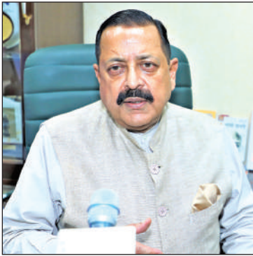
Union Minister Dr Jitendra Singh briefing media about the DoPT decision regarding job selection at New Delhi.

This historic decision has been taken at the behest of Prime Minister Narendra Modi to give