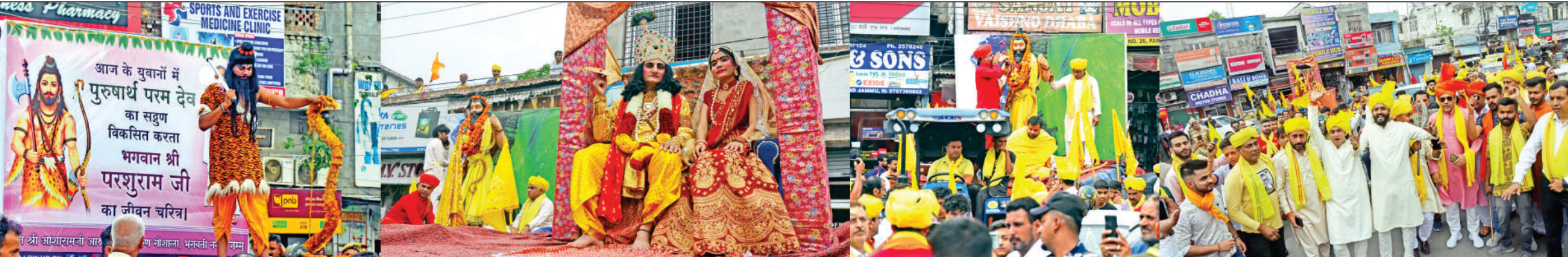
Impressive Shobha Yatra taken out on Parshuram Jayanti by Dogra Brahman Pratinidhi Sabha in Jammu on Tuesday.