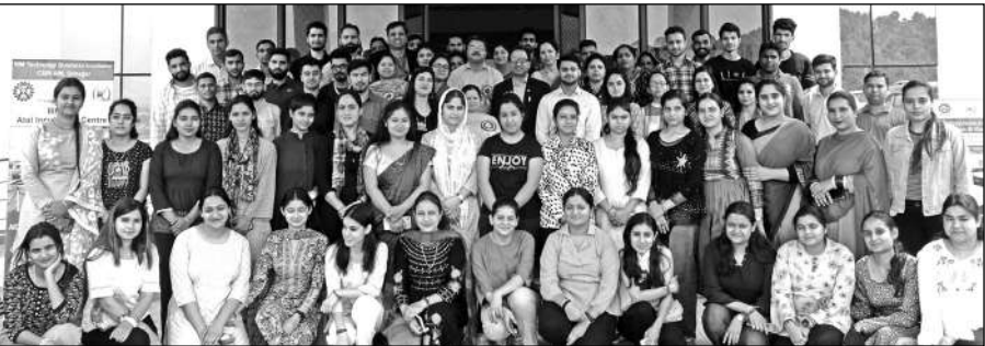
Organisers along with students during the programme at Udhampur.