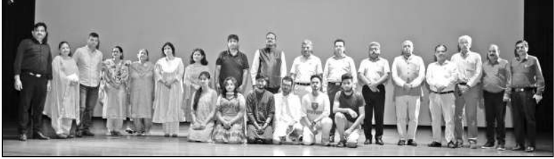
University faculty along with dignitaries and students.