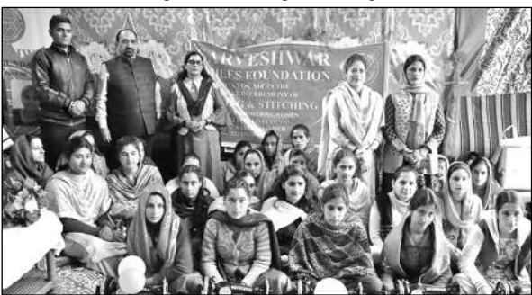
Foundation members along with participant women.