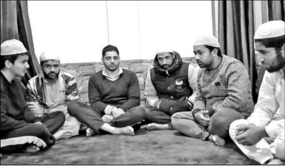
People offering prayers at Bhadarwah.

■ STATE TIMES NEWS BHADARWAH: Hundreds of Muslim devotees converged in different mosques of Chenab Valley to offer special prayers on the eve of Shab-e-Qadr also known as Lyla-Tul-Qadr (Night of power). The holy night when people pray to the Almighty Allah seeking his forgiveness, is observed on 27th night of Ramadhan and according to muslim faith, this is one of the holiest and most blessed night when the believers seek forgiveness of Allah and His Mercy. It is notable that this year there is confusion on the date of Shab-e-Qadr as majority of people started fasting on 23rd of March but some started on 24th March in Union Territory of Jammu and Kashmir. Now some people, who started their fasting on 24th March will observe Shab-e-Qadar tonight. Shab-e-Qadr, the night