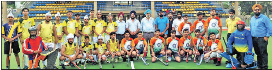
Participating teams posing for a photograph with dignitaries.

JAMMU: Baba Banda Singh Bahadur Hockey Club Poonch and Deshmesh Club Jammu won their respective matches in the ongoing Junior Hockey Men Tournament, organised by Hockey J&K at K K HakKu Stadium, here on Tuesday.