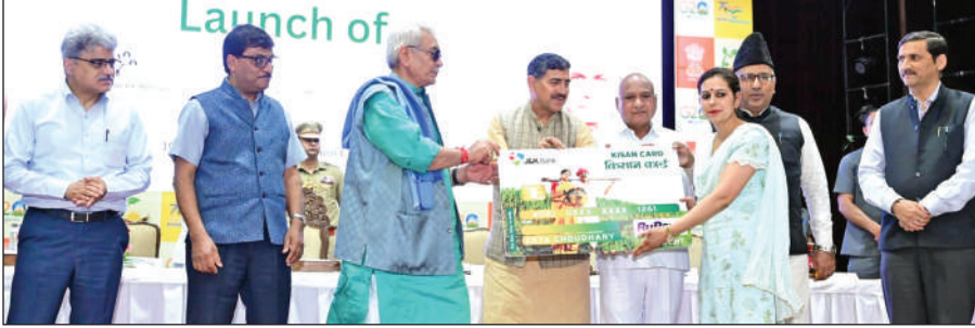
Lieutenant Governor Manoj Sinha handing-over J&K Bank Kisan Card to a beneficiary farmer in Jammu on Wednesday.

10,695 training sessions between April to August 2023 in all 20 districts will bring together entire farming community and the collective resolve will not only make the scheme an unprecedented success but also provide a new direction to young farm-