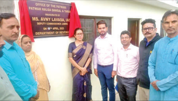
Deputy Commissioner, Avny Lavasa inaugurating Patwar Halqa office at Dansal in Nagrota.