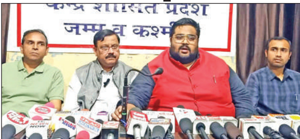
J&K Laghu Udyog Bharati members talking to reporters.

Second Session to start at 11:40 AM upto 3:00 PM in which officials from Ministry of Defence and