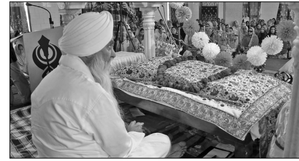
Kirtan organised during the religious event.