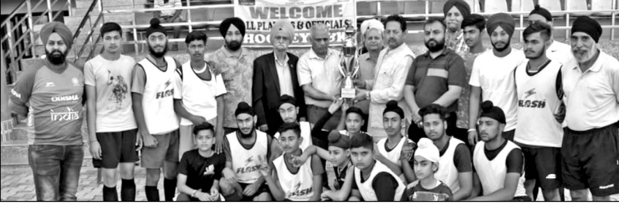
Organisers along with winner team posing with trophy.

■ STATE TIMES NEWS JAMMU: Dashmesh Hockey Club Nanak Nagar bagged the title trophy of the Junior men Hockey Tournament which was organised by Hockey J&K at K K Hakku Stadium, here on Thursday.