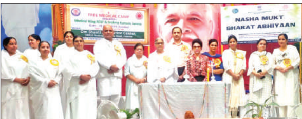
Brahma Kumaris and RERF team at a medical camp.