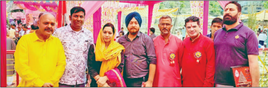
SIBA team members during a camp at Jammu on Sunday.