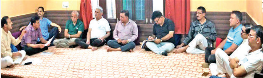
MPSAT members during a general body meeting at Jammu on Sunday.