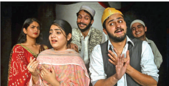
Natrang artists performing in Urdu play 'Kissa Badal Gaya' at Jammu.