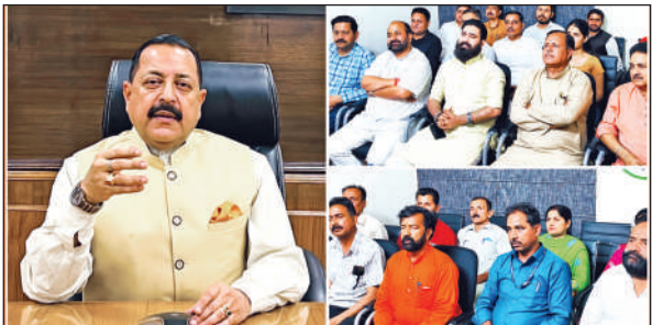
Union Minister Dr Jitendra Singh holding online feedback session with PRI representatives from his Lok Sabha constituency of Udhampur-Kathua-Doda.

vidually with each of the PRI representatives and party members in two groups in two separate sessions respectively lasting one and half hour each for a total period of over three hours. This is part of the recent cycle initiated by him wherein as an MP, he physically visits one district of his constituency every week and tries to connect online with the other district where he is not physically visiting that particular week. To begin with, the Union Minister provided them with an update about some of the latest information regarding the constituency and the new development works approved recently. Dr Singh advised the PRI representatives to listen to the 100th edition of Mann Ki Baat broadcast by Prime Minister Narendra Modi on 30th April. He said, the programme could be given the format of a community listening where a large