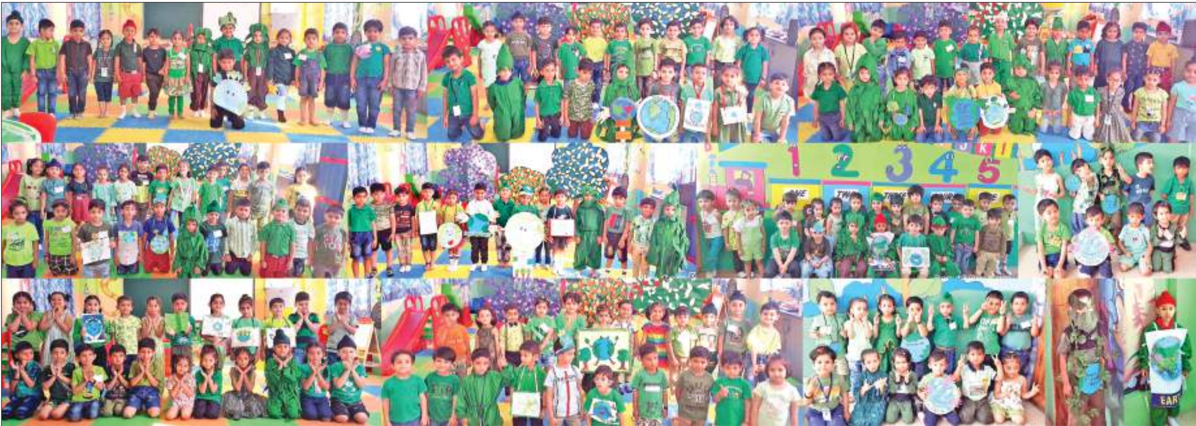
Glimpses of 'Green Day' celebrations at Toddlers' World- a unit of JK Public School Kunjwani.