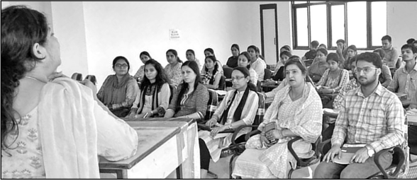
A faculty addressing the students on occasion of World Book Day.