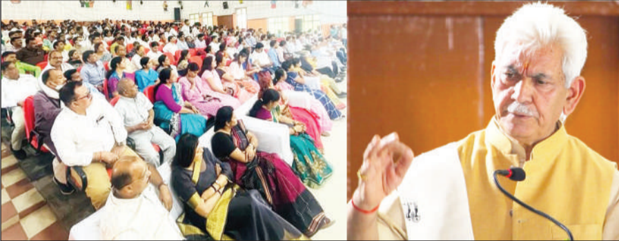
LG Manoj Sinha addressing National Seminar on NEP 2020 at Mahatma Gandhi Kashi Vidyapeeth, Varanasi on Friday.