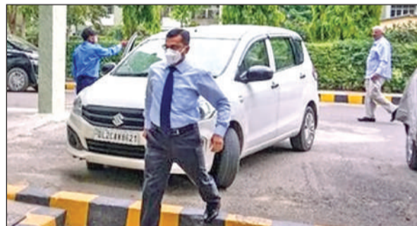
CBI officials arriving at Former J&K Governor Satya Pal Malik's residence at New Delhi on Friday.

A Central Bureau of Investigation (CBI) team arrived at the Som Vihar residence of Malik in the R K Puram area of the national capital around 11.45 am to seek clarifications over his claims, they said.