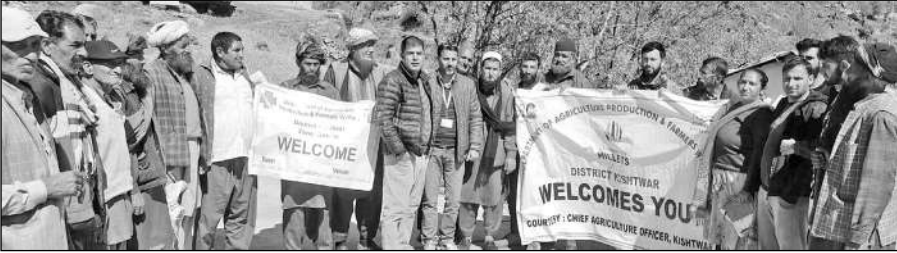
Agri officials along with farmers during the camp at Kishtwar.