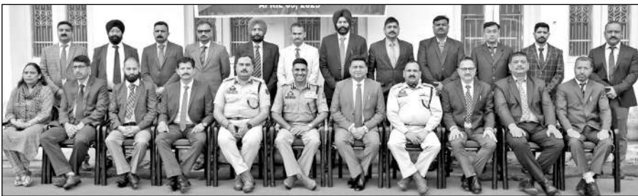
SKPA officials along with trainee officers at Udhampur.