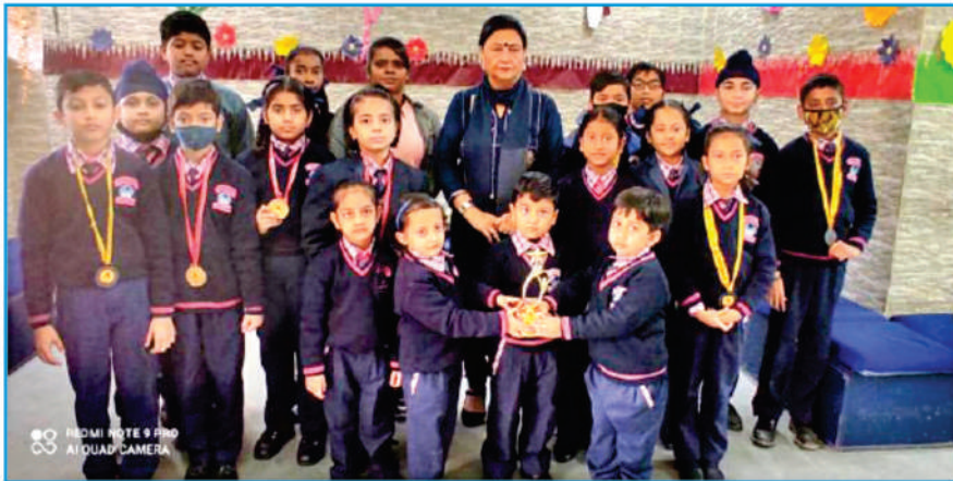
13 Gold Medal, 2 silver medal and 4 bronze medals winners in Traditional Karate Championship 2022 at Indore Sports Complex, Jammu.