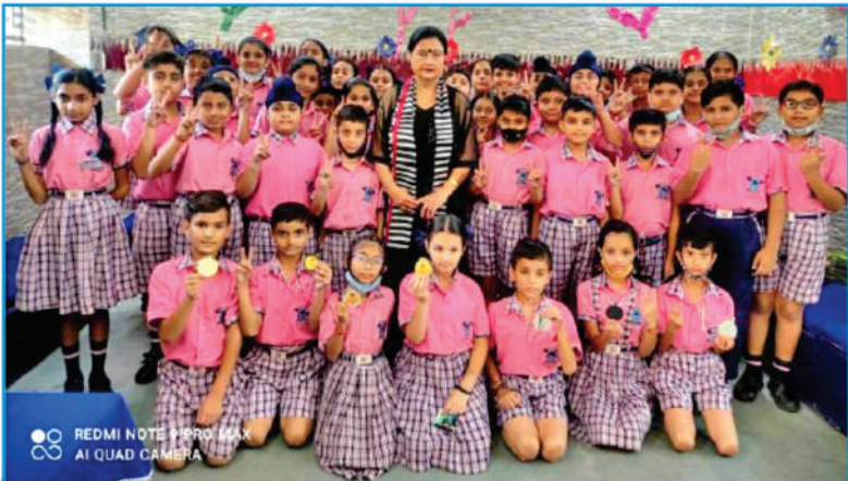
12 Gold medal, 18 Silver Medals and 12 Bronze medal winner in Open J&K UT QWAN KI DO Championship 2022 organised by Qwan Ki di association of JK

JAKIANS –SURGING AHEAD GLOBALLY JKIIANS excelling in Sports Arena