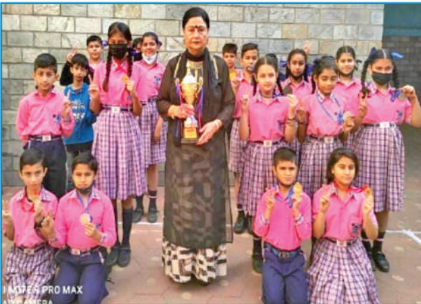
5 Silver medals and 7 Bronze medal winners in 1st District Matsogi-Do Championship 2022 organised by Matsogi do Association of Jammu and supported by INARA WELFARE TRUST.