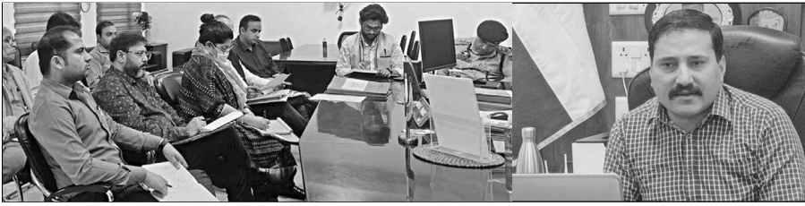
Deputy Commissioner Kathua, Rahul Pandey chairing a meeting.

■ STATE TIMES NEWS KATHUA: Deputy Commissioner, Rahul Pandey chaired a meeting of the District Level Committee under the Nareo Coordination Centre (NCORD) to discuss anti-drug measures in the district. The meeting discussed issues related to drug addiction, areas of concern and hotspots of drug abuse, and measures taken by law enforcement agencies. The DC stressed on mapping vulnerable spots in the district and providing awareness to community members. The DC asked Chief Education Officer Kathua to launch an awareness campaign in schools and for proper counselling of parents during parent-teacher