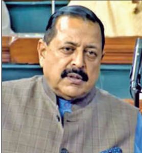
Union Minister Dr Jitendra Singh speaking in the Lok Sabha.

He said, the Government has accorded administrative approval and financial sanction for 10 indigenous Pressurised Heavy Water Reactors of 700 MW each in fleet mode. As per the details, two nuclear reactors each had been approved for each of the three States of