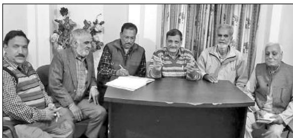
Members of forum during the meeting at Katra.