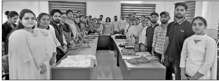
Resource persons along with students and faculty during the programme.