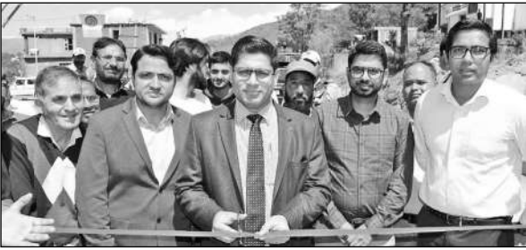
DC Vikas Kundal inaugurating developmental works.