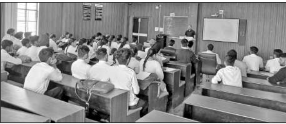
A resource person expressing views.