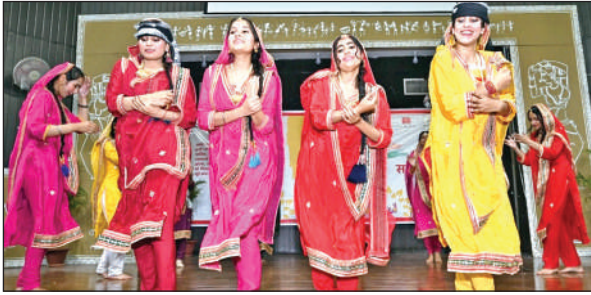
Students presenting a cultural item during Panch Pran Utsav in Jammu.