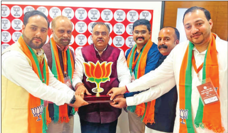
BJP Social Media team presenting memento to BJP National General Secretary, Tarun Chugh.

"Besides, efforts should be made to form WhatsApp groups in every district which would serve as a platform for exchanging information relating to the good work done by the Modi government," he said.