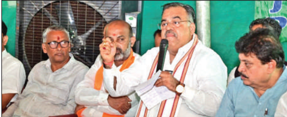
BJP National General Secretary Tarun Chugh speaking at a meeting at Hyderabad.

HYDERABAD: BJP National General Secretary Tarun Chugh on Friday said that the bail granted to Telangana BJP president Bandi Sanjay was not only a slap on the face of the KCR government but also a victory for the common man whose cause Sanjay had been fighting in the wake of repeated incidents of question paper leakages. Chugh, who on behalf of BJP President paid a visit to the family of Sanjay, said KCR, who is seeped deep into corruption, has been trying to stifle the voice of lakhs of youth in Telangana. "The way Sanjay had been waging a war against the KCR government after it had cheated lakhs of students