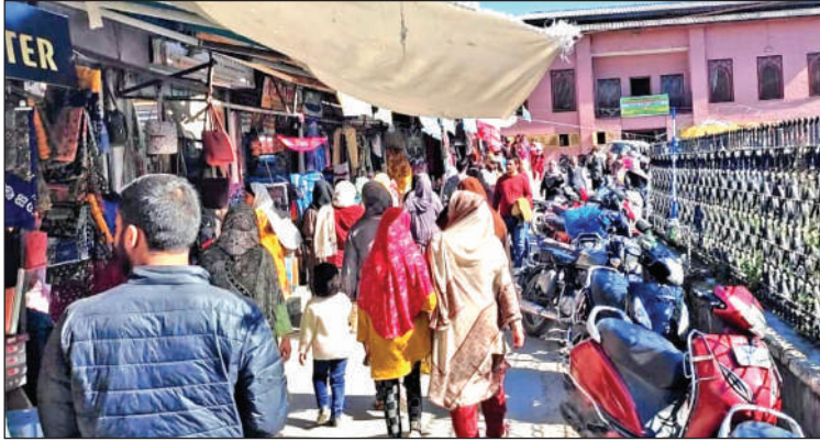
Markets in Kashmir abuzz with activity on Tuesday.

According to the traders the demand for edible items, particularly mutton, bakery goods, and con-