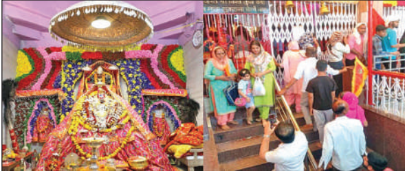
Devotees paying obeisance at Sukrala Mata Shrine and the Mata Bala Sundri Shrine.

Devotees hailing from different parts of Jammu Kashmir and neighboring states con-