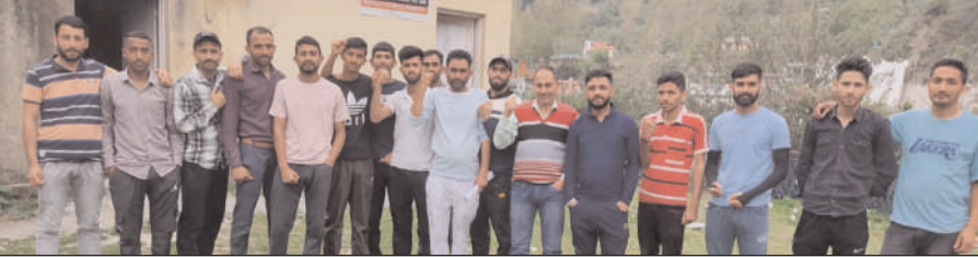
Youth of Bani during a campaign for ST status.

■ STATE TIMES NEWS BANI: The youth of Bani have spoken resoundingly on the fundamental issue of Pahari Scheduled Tribe (ST) status, aligning their demand with the cultural and linguistic heritage shared by the community. In the wake of the recent declaration of ST status to Rajouri and Poonch based on their Pahari identity, the people of Bani have fervently called for similar recognition, citing their cultural affinity and linguistic ties to the Phadi language. The intensifying momentum surrounding the issue underscores the growing sentiment among the populace, particularly in Bani, where the demand for Pahadi ST status has gained significant traction. Residents are dismayed by government reports suggesting an absence of Phadi-speaking population in Kathua district, perceiving it as a grave injustice that neglects their cultural identity and heritage. In light of this, the community has issued a fervent