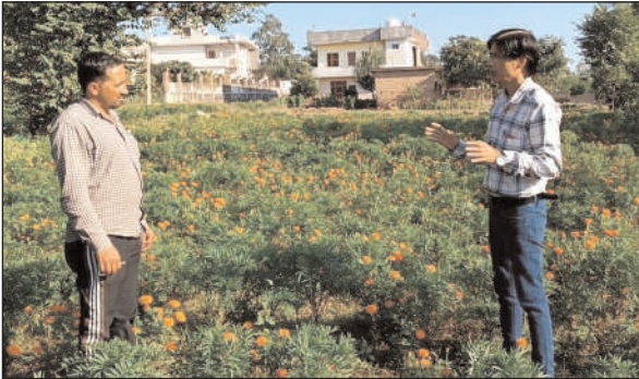
KVK, Reasi scientist guiding a rural youth on commercial floriculture at Bhakta village in Reasi distt. of J&K.